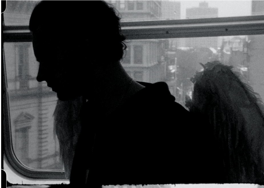
(Still from "Pretty" - cred Angela Ricciardi)